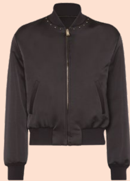
DOUBLE SATIN BEVERLY PALMS BLOUSON by VERSUS VERSACE

£1,830 versace.com 31 Redchurch St, E2 7DJ 12 minutes walk