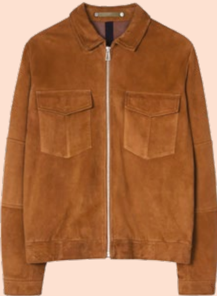
MEN'S TAN SUEDE PATCH-POCKET JACKET by PAUL SMITH

£320 montblanc.com 10-11 Royal Exchange, EC3V 3LL 13 minutes walk