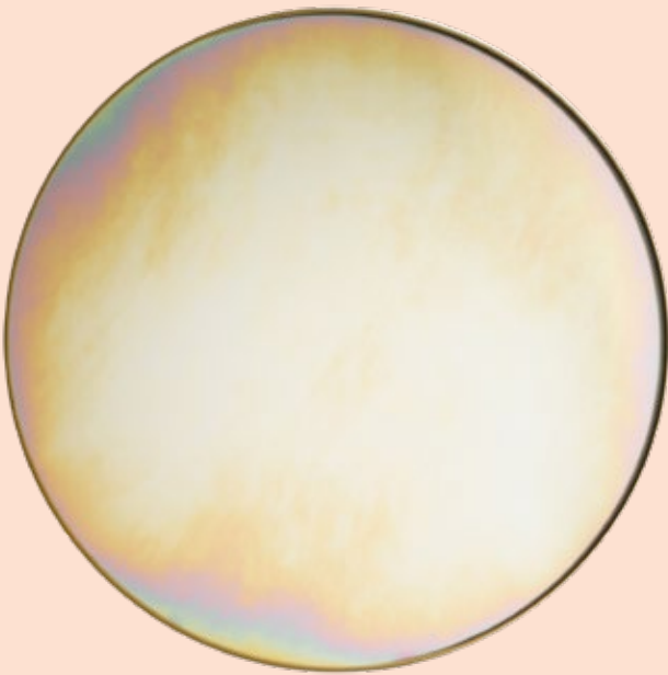
MIRROR GOLD by STUDIO ROSSO

£550 monologuelondon.com 93 Redchurch St, E2 7DJ 14 minutes walk