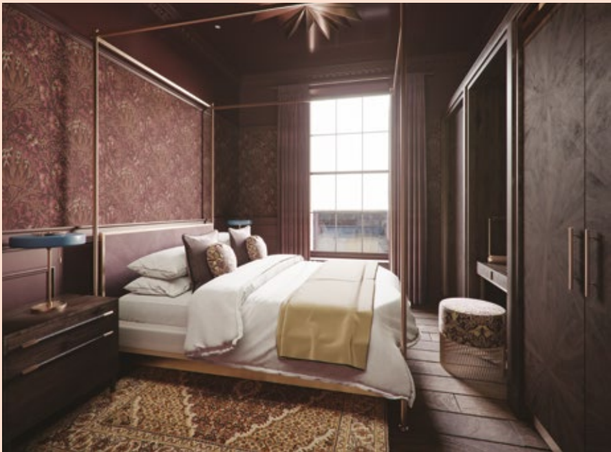
Clockwise from top left - Computer generated image of the bar George Dance the Younger Computer generated image of the bedroom Computer generated image of the hotel exterior