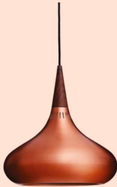
ORIENT P2 PENDANT by JO HAMMERBORG

£1,830 versace.com 31 Redchurch St, E2 7DJ 12 minutes walk