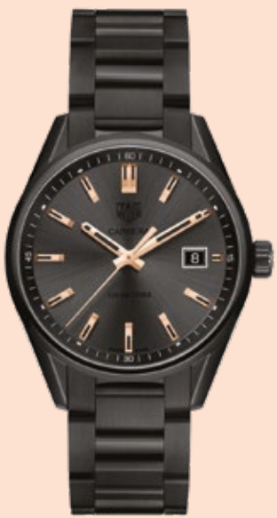
LADIES CARRERA WATCH by TAG HEUER

£13,950 monologuelondon.com 93 Redchurch Street, E27DJ 14 minutes walk