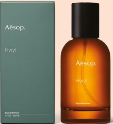
HWYL by AESOP

£600 paulsmith.com 7 Royal Exchange, EC3V 3LQ 13 minutes walk