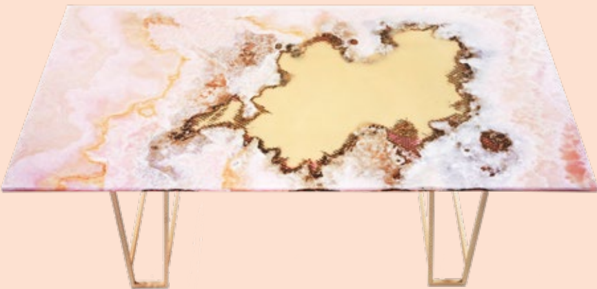
CANYON MARBLE DINING TABLE by PATRICIA URQUIOLA

£474 scp.co.uk 135-139 Curtain Road, EC2A 3BX 11 minutes walk