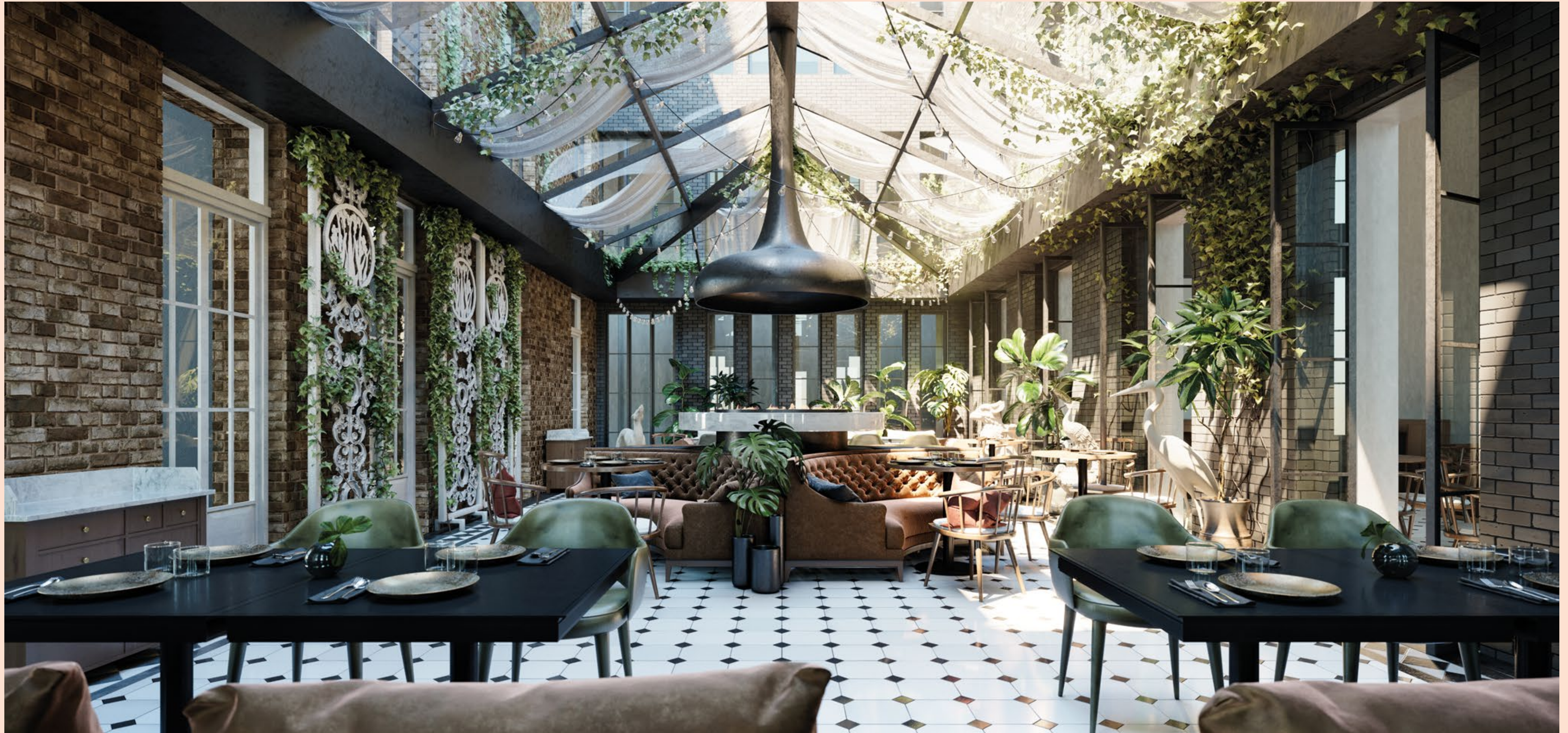
Computer generated image of the restaurant