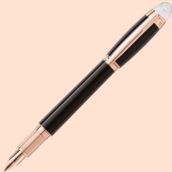
STARWALKER RED GOLD RESIN FOUNTAIN PEN by MONTBLANC

£550 monologuelondon.com 93 Redchurch St, E2 7DJ 14 minutes walk