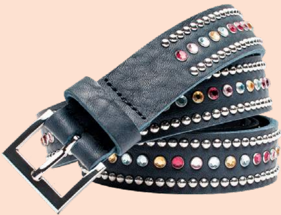
AYLA CLOUS BELT BY ZADIG AND VOLTAIRE

61-63 Brushfield Street, London E1 6AA 🚶 11 minutes walk