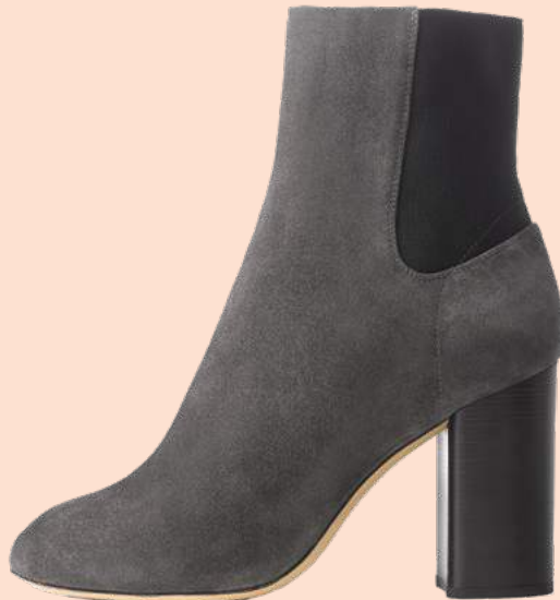
AGNES BOOT by RAG AND BONE

61-63 Brushfield Street, London E1 6AA 🚶 11 minutes walk