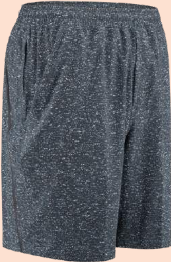
PACEBREAKER SHORTS by LULULEMON

20 Hanbury Street, Spitalfields, London E1 6QR 🚶 12 minutes walk