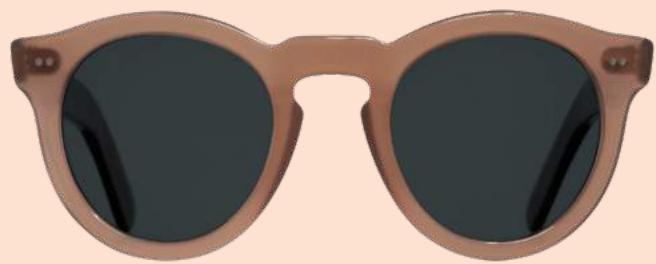
SUNGLASSES by CUTLER AND GROSS