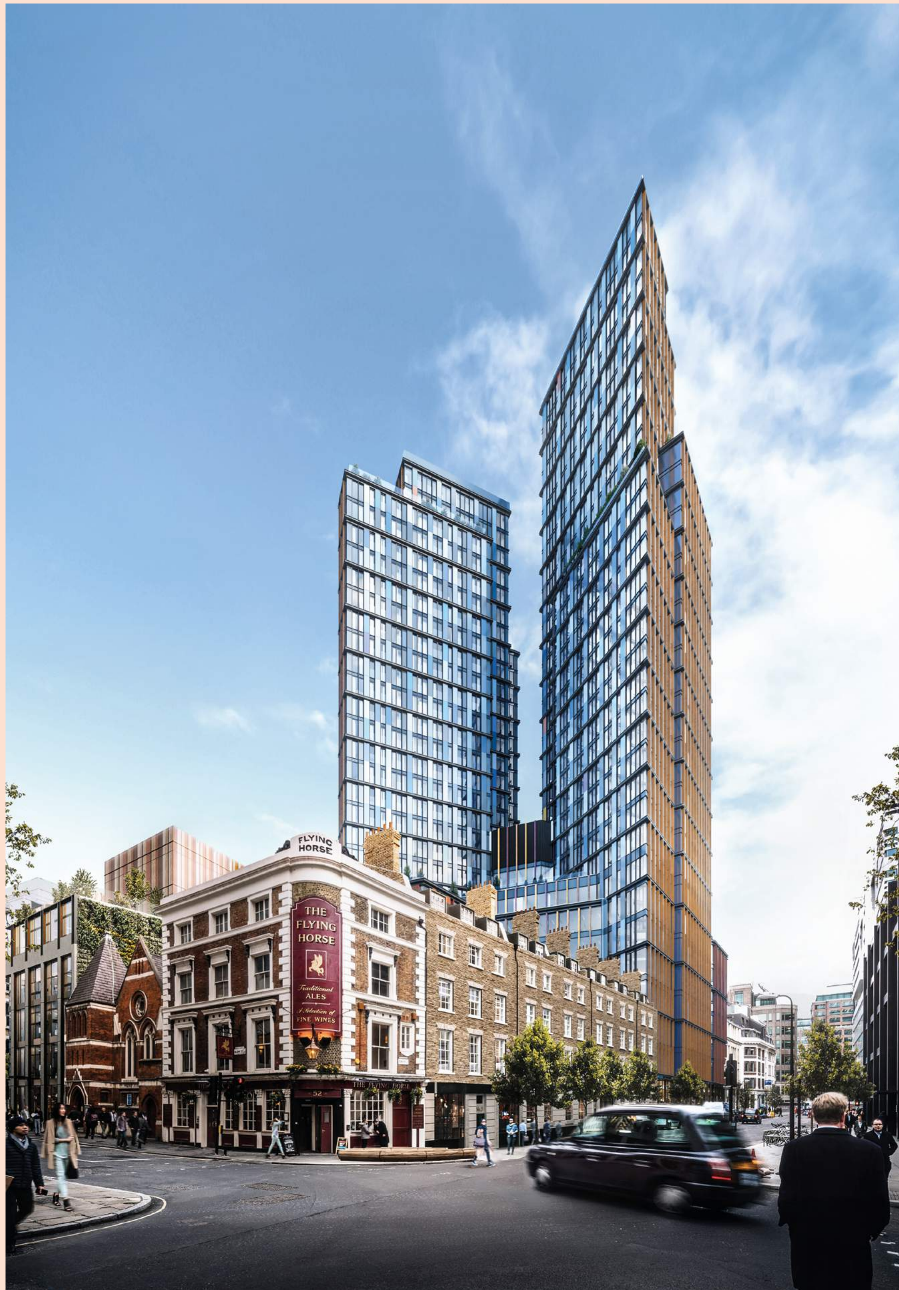
CGI of One Crown Place