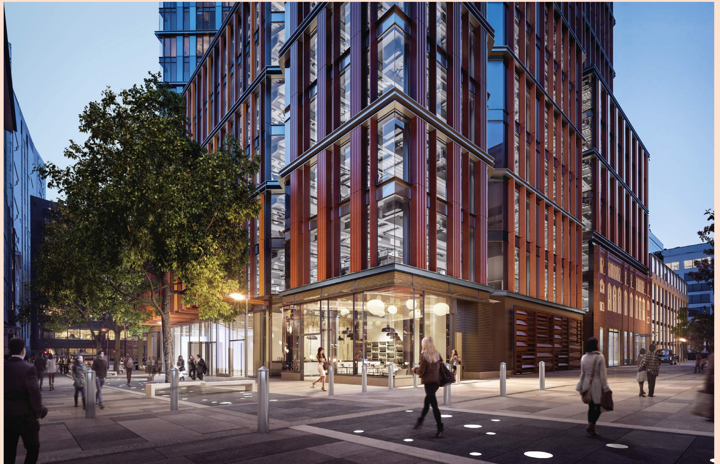
CGIs of One Crown Place

A dramatic new addition to London's iconic skyline, the design of One Crown Place celebrates changing perceptions of what the City stands for: the old-meets-new character of the EC2 postcode that artfully combines original heritage buildings with striking modern architecture. Though KPF do them so well, it is an antidote to the capital's ubiquitous glass towers, says Bushell. "This is one of the jewels in the crown: a really intricate mixed use scheme which will transform the area. We considered at great length how to have two towers on the site from which the many views would not appear over-bearing and the vertical forms would be accentuated." It's big architecture with a beating heart. Who would have thought it could be possible?