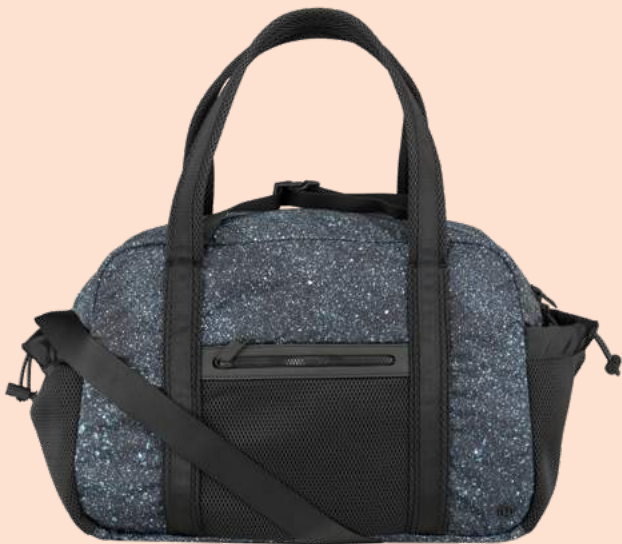
EVERYWHERE DUFFEL BAG BY LULULEMON

113 Commercial Street, London E1 6BG 🚶 11 minutes walk