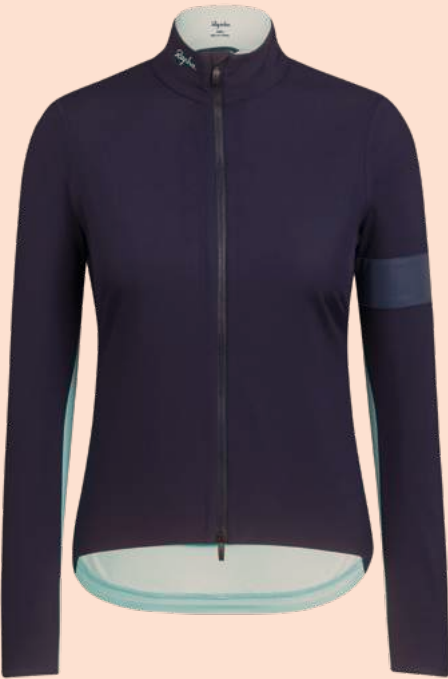
WOMEN'S SOUPLESSE TRAINING JACKET by RAPHA

55 Brushfield Street, London E1 6AA 🚶 11 minutes walk