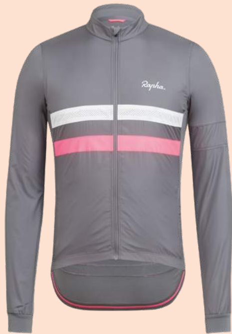
MEN'S BREVET WINDBLOCK JERSEY by RAPHA