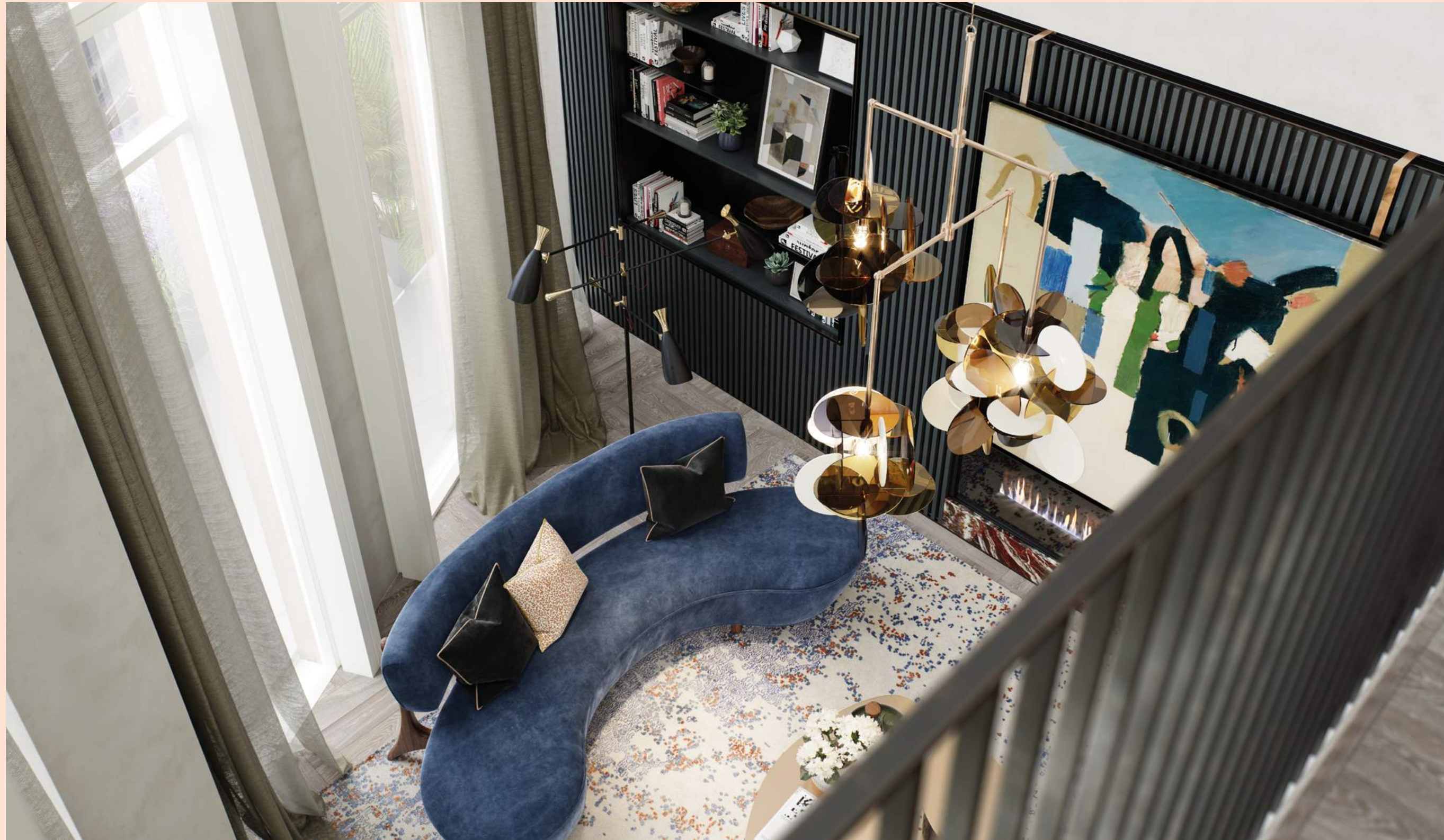
CGIs of apartments at One Crown Place