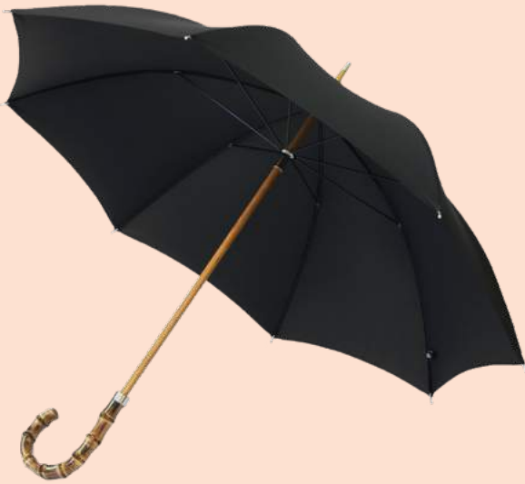
CITY GENT WHANGEE W1 UMBRELLA by LONDON UNDERCOVER

107a Commercial Street, London E1 6BG 🚶 11 minutes walk