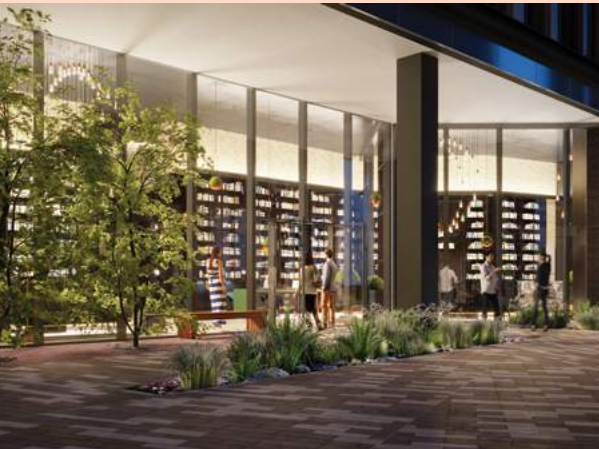
One Crown Place CGIs clockwise from top left:

Wellness has become a key concept in high-quality new residential development, with proven links between the proximity to greenery and its benefits on our emotional and physical health. For urban designers such as Bernward Engelke, promoting environmental wellness by bringing colourful planting, water and wildlife into the cityscape is crucial. "Property developers know that it's an asset to have a well-functioning green infrastructure, but it's also a responsibility. We need to focus on the benefit of green space in the public realm, particularly as the city becomes ever more dense and many new high rise buildings are emerging," he says. "By promoting landscape-led master-planning, we are focusing on place-making that puts people first."