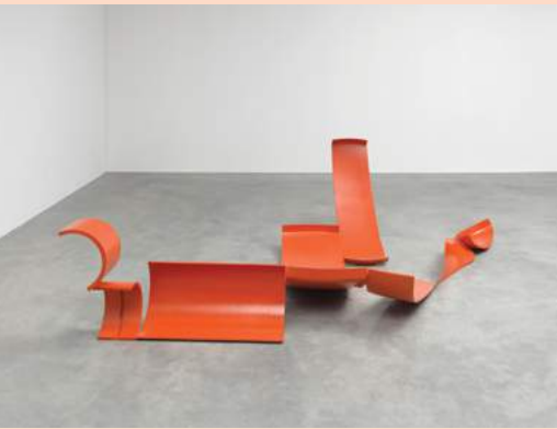
Frieze Masters Anselm Kiefer, Berlin, 1989. Steel, painted brown, 90 x 234 x 315 cm

5 – 8 OCTOBER 2017 Frieze London and Frieze Masters 2017