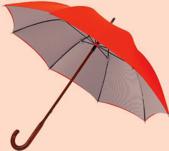
ORANGE & OXFORD STRIPE UMBRELLA by LONDON UNDERCOVER £75 londonundercover.co.uk 20 Hanbury St, Spitalfields, E1 6QR