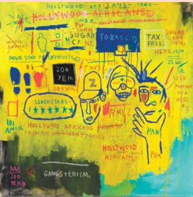
Jean-Michel Basquiat Hollywood Africans, 1983

21 SEPTEMBER 2017 – 28 JANUARY 2018 Basquiat: Boom for Real