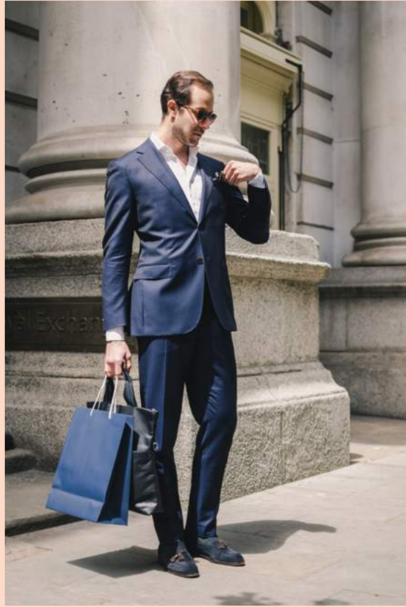
Oyidiu – The City INVESTMENT BANKER