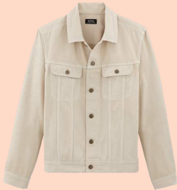
BENJAMIN JACKET by APC £255 apc.fr 15 Redchurch St, E2 7DJ