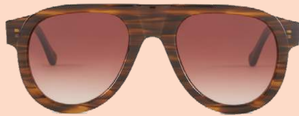
DUKE SUNGLASSES by TOM WOOD £292 goodhoodstore.com 151 Curtain Rd, EC2A 3QE