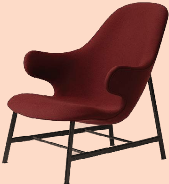
CATCH LOUNGE CHAIR by JAIME HAYON £1,740 monologuelondon.com 93 Redchurch St, E2 7DJ