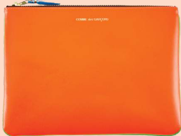
TANGERINE WALLET by COMME des GARÇONS £87 goodhoodstore.com 151 Curtain Rd, EC2A 3QE