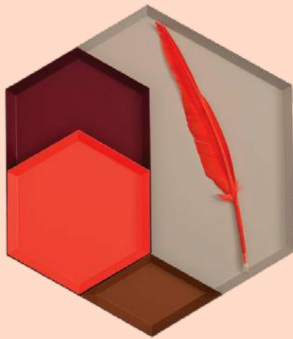
KALEIDO RED PLATE by CLARA VON ZWEIGBERGK £29 monologuelondon.com 93 Redchurch Street, E2 7DJ