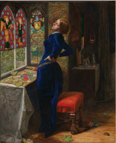
John Everett Millais Miriamna, 1861 Oil on mahogany, 597 x 495 cm © The Trustees of the National Gallery © 2016, London 2016

4 OCTOBER 2017 – 2 APRIL 2018 Reflections: Van Eyck and the Pre-Raphaelites