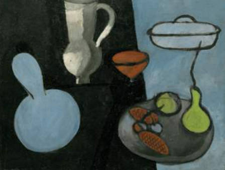
Henri Matisse, Gourde 1925. Oil on canvas, 65 x 82 cm The Museum of Modern Art, New York. Mrs. Simon Guggenheim Fund, 100935 Photo © Archives H. Matisse © Succession H. Matisse DACP 2017

5 AUGUST – 12 NOVEMBER 2017 Matisse in the Studio