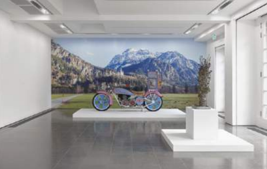
Grayson Perry, Installation view Serpentine Gallery, London (28 June 2017 - 10 September 2017).

8 JUNE – 10 SEPTEMBER 2017 Grayson Perry: The Most Popular Art Exhibition Ever!