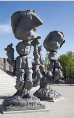
Paul McCarthy Two Boys and a Girl 2017. Alloy, steel, stone (Boy) 525 x 208.3 x 889.2 cm (Girl) 546.1 x 202.8 x 213.4 cm ©Paul McCarthy

27 JUNE 2017 – MAY 2018 Sculpture in the City 2017