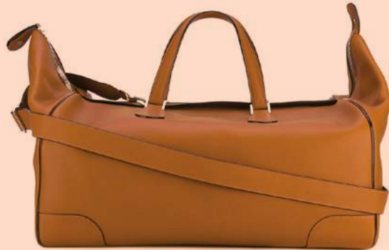
PORTOFINO TRAVEL HOLDALL by VALEXTRA £3,110 hostem.co.uk 28 Old Nichol St, E2 7HR

This season's hand-picked pieces from our favourite independent stores in Shoreditch