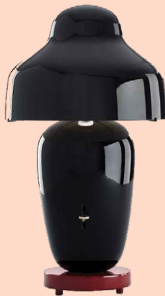
CHINOZ BLACK TABLE LAMP by PARACHILNA £1,335 monologuelondon.com 93 Redchurch St, E2 7DJ

This season's hand-picked pieces from our favourite independent stores in Shoreditch